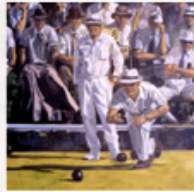
One Art Print Il Punto Inziale €320.00