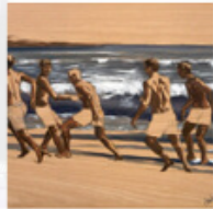
One Art Print Matchin Capellina €320.00