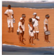
One Art Print Mikano €320.00