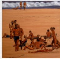
One Art Print American Graffiti €320.00