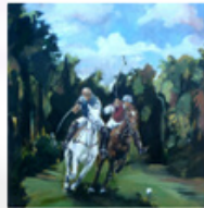
One Art Print Sognando la Vittoria €320.00