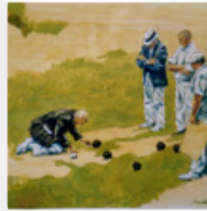
One Art Print La Misurazione €320.00