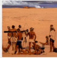
One Art Print American Graffiti 2 €320.00