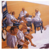
One Art Print Corleone €320.00