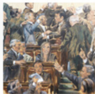
One Art Print Sparlamento €320.00