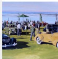
One Art Print Vintage Car Meeting €390.00