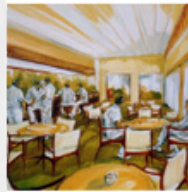
One Art Print Il Caffè del Club €320.00